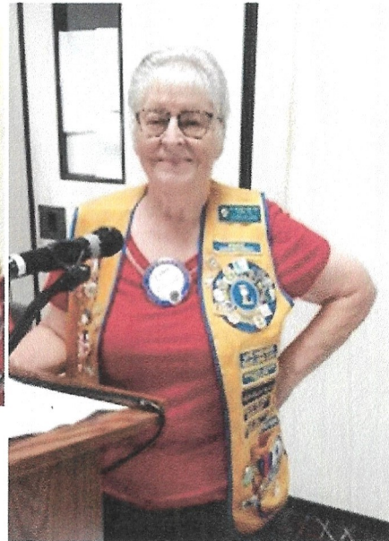
SPEAKER JULY 11

WITH THE TEXAS WORKFORCE REHABILITATION PROGRAM