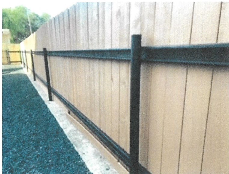
THE FINISHED FENCE