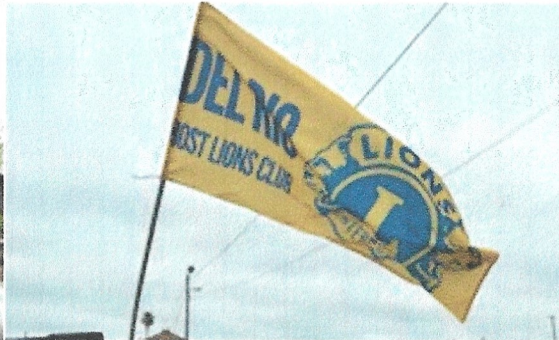
OUR NEW FLAG